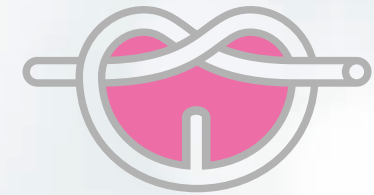
Tongue & Lip Tie